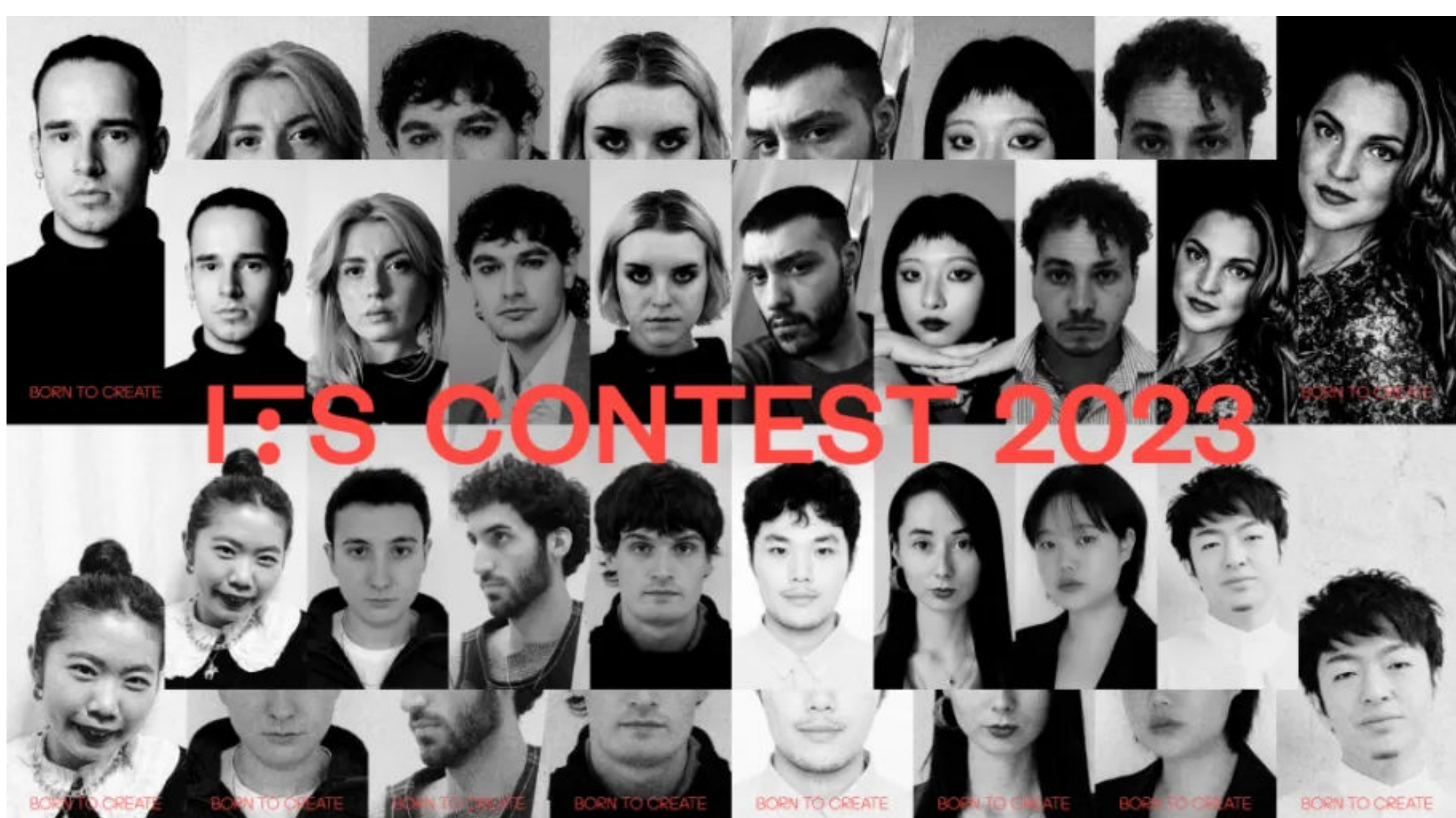
The 16 finalists of the 2023 International Talent Support contest.

By MARTINO CARRERA NOVEMBER 22, 2023, 1:49PM